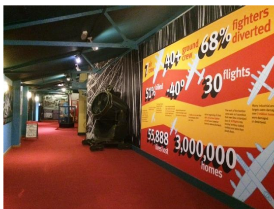
Bomber Command Exhibition