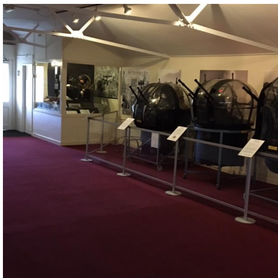
Air Gunners display

Information about items on display in galleries is provided through wall texts and other contextual and complementary information. We also use QR codes for access to 360 VR photography and veteran interviews. From time to time, temporary exhibitions allow items not normally on display in the galleries to be shown to the public. This also allows items to be displayed in different contexts alongside items from other collections.