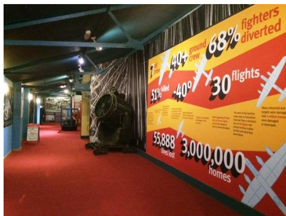
Bomber Command Exhibition