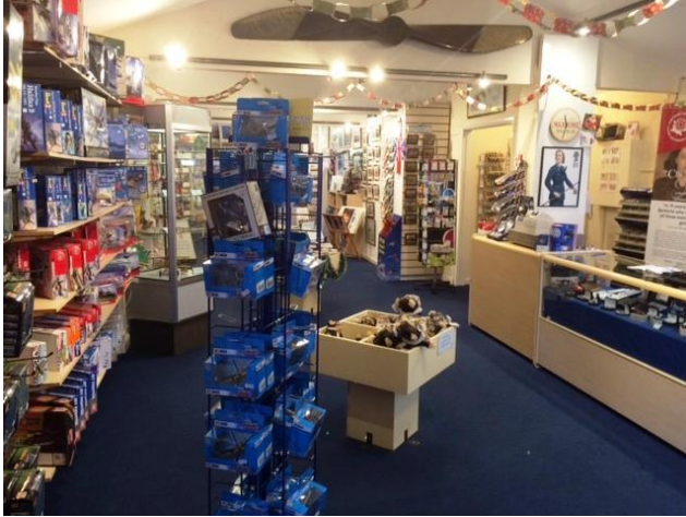
Yorkshire Air Museum Gift Shop

There are tall display racks and low units accessible from a seated position.